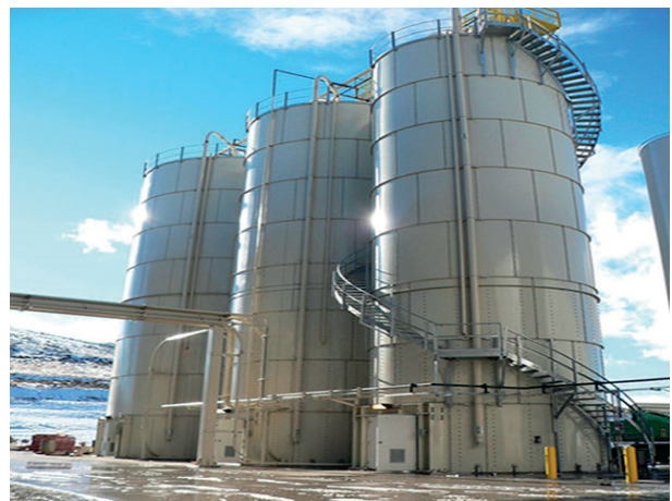
Figure 3. Pneumatic conveyance of finished cement powder to storage silos.

Cement plants run continuously and to maintain operations, finished cement powder must be transported to a storage silo, as over-accumulation or backlogs can lead to a plant shutdown. Aerzen Delta blower, hybrid or screw compressors can be configured to handle elongated pipe distances and a wide range of pipe diameters to guarantee constant flow and mitigate pipe clogging.