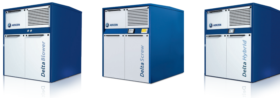
Figure 1. Delta blower, screw, and hybrid compressors.

Pro Global Media's comprehensive Global Cement Directory found 406 cement plants operating in the Americas. Of those, 57% of them source Aerzen blowers, rotary lobe compressors, and screw compressors.